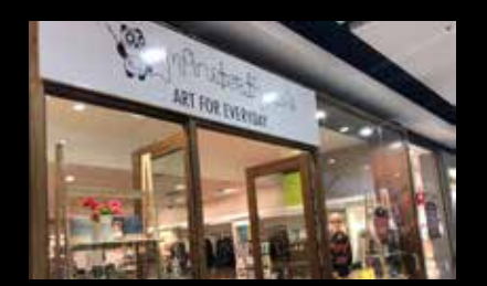
Monster Threads, Level 3