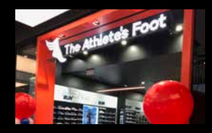
New Look Athlete's Foot, Level 2